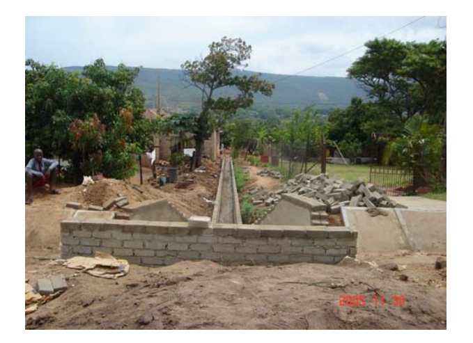
Refurbishment of street at Highpoint in Ga-Kgapane